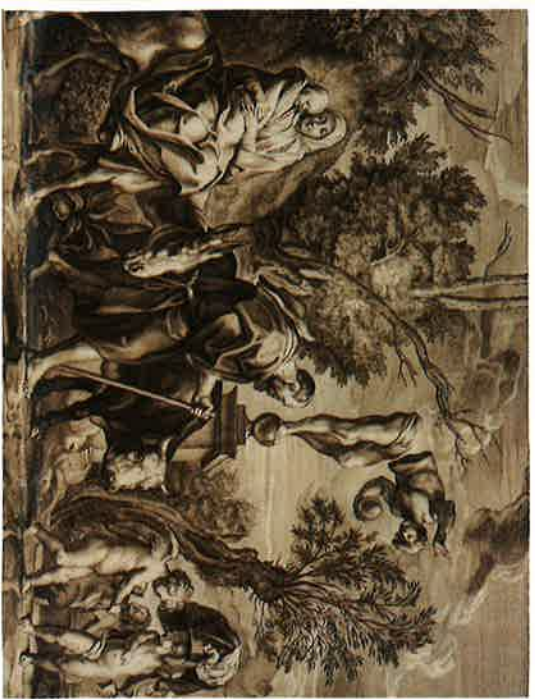
Flight into Egypt Paul Pontius mid -17th century

Yet only with the 15th century development of engraved metal plates and movable type – which made possible the publication of artistic prints, books and illustrations – were the greatest