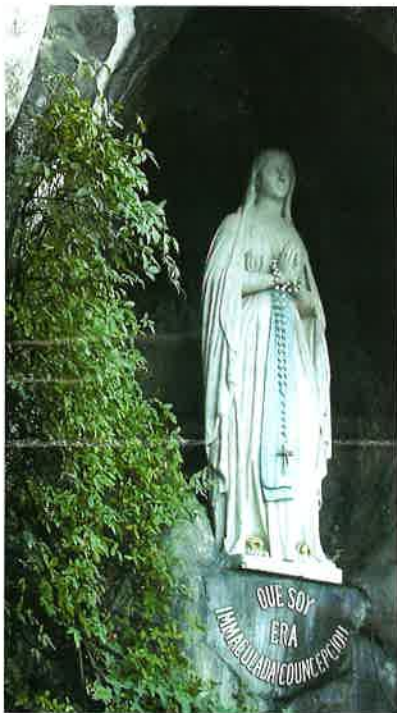
The Grotto at Lourdes, France

December 8, 2004 will mark the 150th Anniversary of the Doctrine of the Immaculate Conception. On March 25, 1885, at the Grotto of Massabielle, Lourdes, Bernadette asked Mary her name four times before Our Lady answered in the local dialect, " Que soy era Immaculada Conception. " In this we see the confirmation of the doctrine proclaimed four years earlier in 1854 by Pope Pius IX that Mary was conceived without sin.