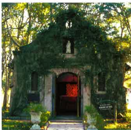
Mission Nombre de Dios

Many women visit the Shrine every year to ask for the blessings of motherhood, beseeching the intercession of Our Lady of La Leche that God will grant them a safe and happy delivery, and healthy, holy children.