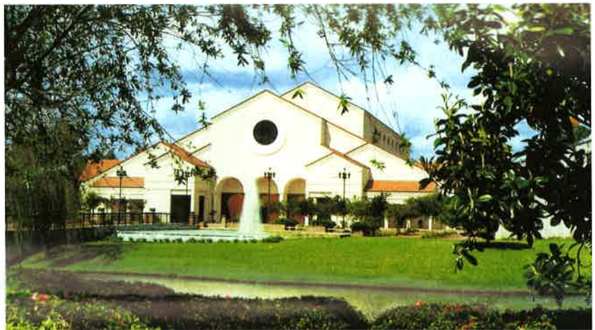
Mary, Queen of the Universe Shrine

The internationally popular Shrine of Mary, Queen of the Universe in Orlando is the newest Shrine in Florida dedicated to the Blessed Mother. This Marian Shrine was built to welcome the hundreds of thousands of tourists who arrive from all over the world to visit the area's theme parks. The main church has accommodation for almost 3,000 worshippers. In addition to daily and weekend Masses, the Sacrament of Reconciliation is available every day. Thousands of visitors stroll around the grounds of the Shrine, praying in the beautiful Rosary Garden or meditating in the outdoor Mother and Child Chapel,