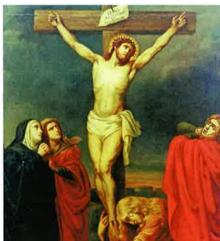
The 14th Station at Mary, Queen of the Universe Shrine