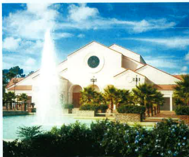
Mary, Queen of the Universe Shrine

“Marian shrines are like the house of the Mother, refreshment and rest points on the long road that leads to Christ. They are forges, where, through the simple and humble faith of the ‘poor in spirit,’ one comes in contact again with the great wealth that Christ has entrusted and granted to the Church.”