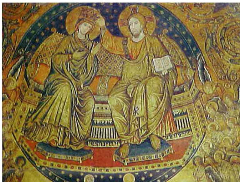
Christ the King crowning His Mother (Ceiling Mosaic in the Basilica of St. Mary Major in Rome, Italy)

The beginning of the concept that Mary is a Queen is found in the annunciation narrative. For the Angel