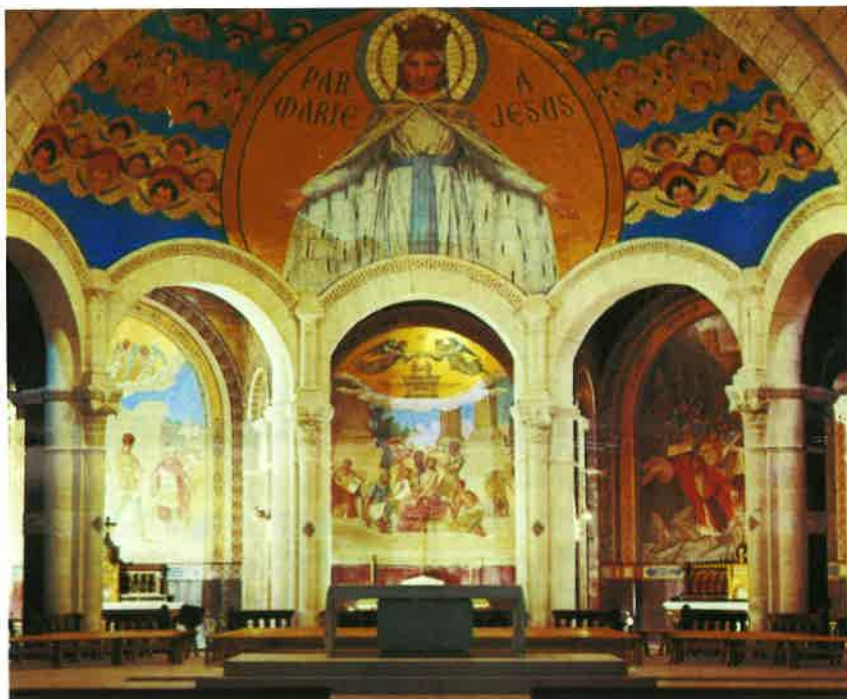
“To Jesus through Mary” – the Mosaic-tiled ceiling in the Basilica of the Rosary at Lourdes, France.

As a theologian, he wrote about Mary as a mother who could unite all people. As a bishop and later as Pope, he chose as his motto Totus Tuus , Latin for “completely yours”,