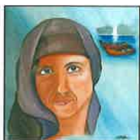
Salome by Cotter

Campos. It was after viewing rare photographs of Leonardo da Vinci’s original charcoal sketches of the “Last Supper” that Campos re-created what da Vinci accomplished. The exhibit “Homage” was developed for the Basilica