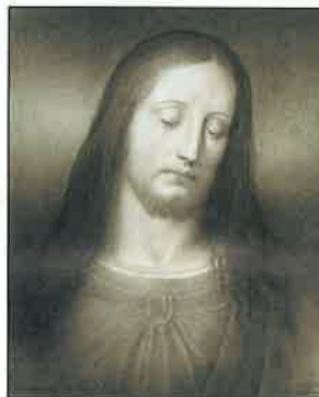
Jesus Christ by Campos

Museum and featured Campos’ artwork with interesting juxtapositions of the Old World and the modern.