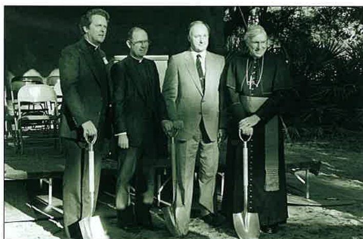
On December 8, 1984, ground was broken for the first construction phase.