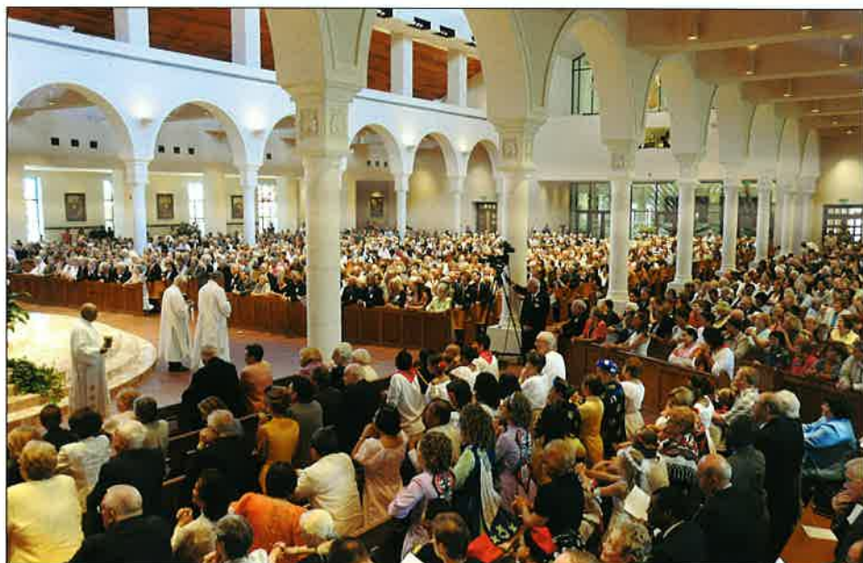
The community of believers gather at Mary's Shrine to witness the fruits of 25 years of devotion, prayer and generous support that made the "Basilica" a reality.