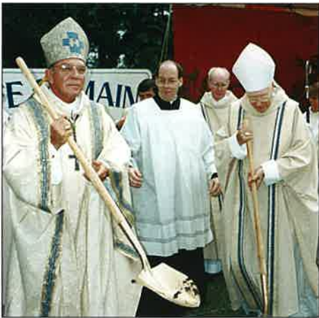
August 22, 1993, the feast of Mary's Queenship, saw the groundbreaking for the new main church.