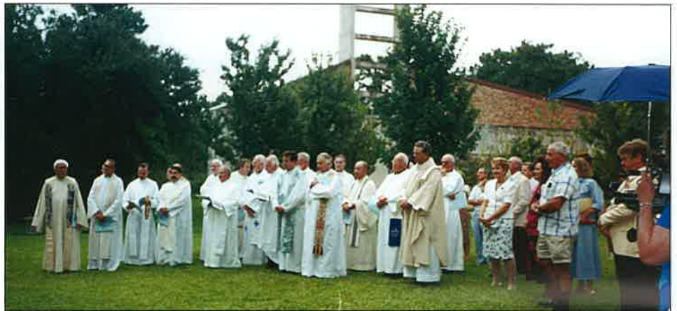
Priests and visitors gather for groundbreaking