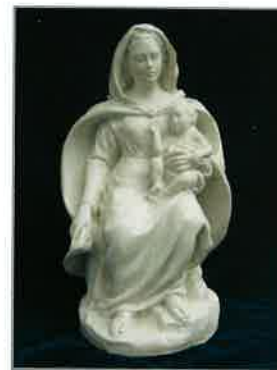
Mary, Queen limited edition statue $125

The store is open Monday – Friday 8:30 – 5:00, and weekends from 8:30 – 8:00. If you can't make it into the shop, visit us on-line at www.maryqueenoftheuniverse.org or place a phone order at 407-239-4010. Please let us know if you would like your purchase blessed by one of our priests before shipping, and as always, we offer complimentary gift wrapping.