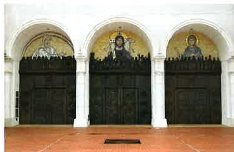
Open Wide The Doors To Christ