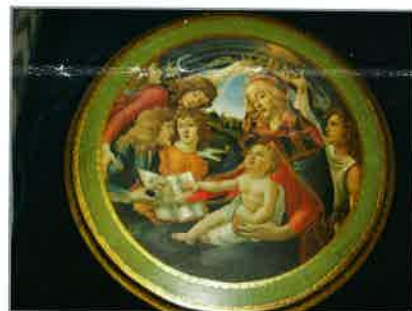
Magnificent imported florentine icon, $76.95