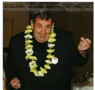
Guests were entertained by the humor and wit of our Jubilarians