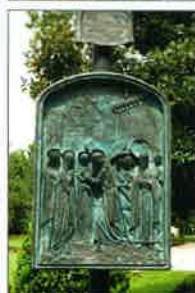
Jesus Meets His Sorrowing Mother