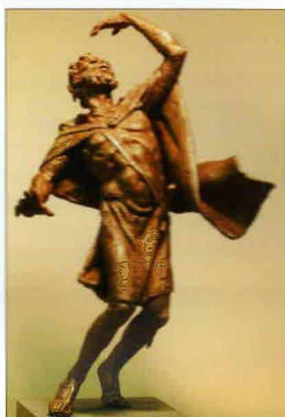
The Conversion of St. Paul. sculptor's model

For too often we drape ourselves in the soft comforts of compromise and rationalization. We might not fear to judge others but we lose heart at the prospect of placing our own thoughts and deeds before the mirror.