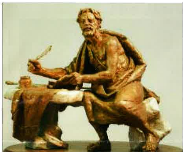
St. Paul the Apostle. sculptor’s model