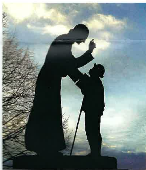
Picture of the Statue of St. John Vianney and the boy he encountered

Please pray for all sojourners who come seeking God's compassionate love – seeking Jesus, the Light of our New Year, and every year.